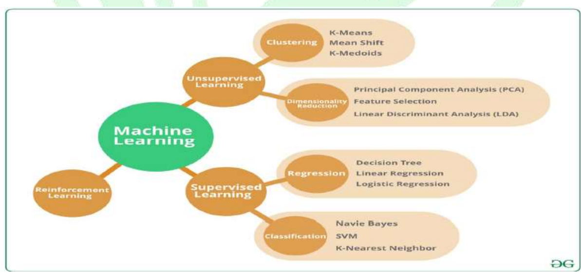
Fig 1: Different types of machine learning algorithms

Machine learning is the process of teaching machines how to perform any task, no matter how simple or difficult it is. The process of making machines think and perceive things like humans is known as machine learning.